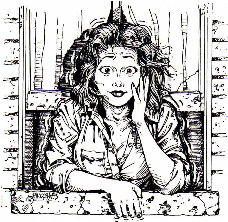
A SCENE FROM "WALKING ON GLASS"